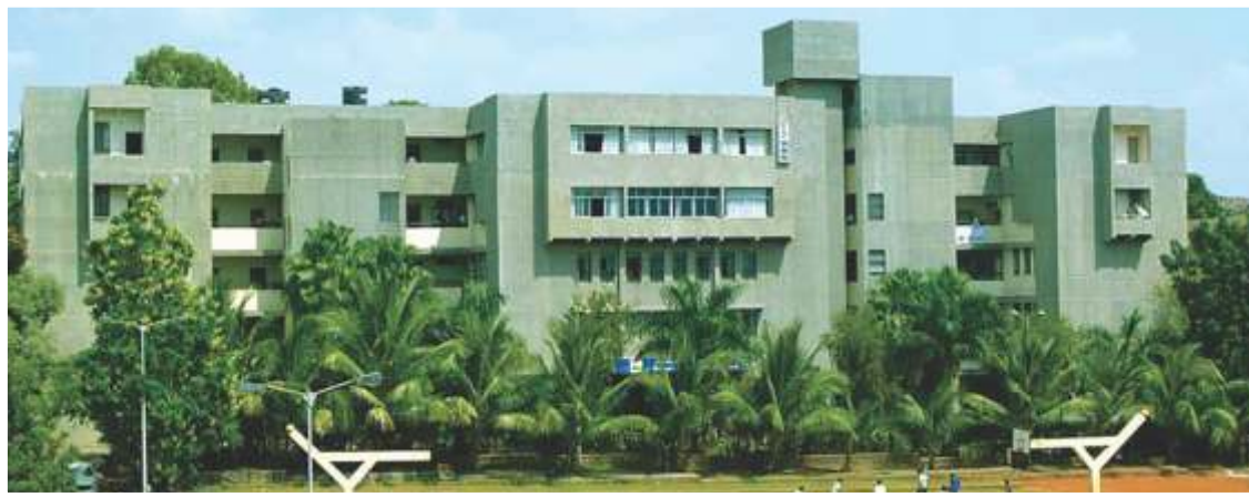
Institute of Management and Entrepreneurship Development, Pune