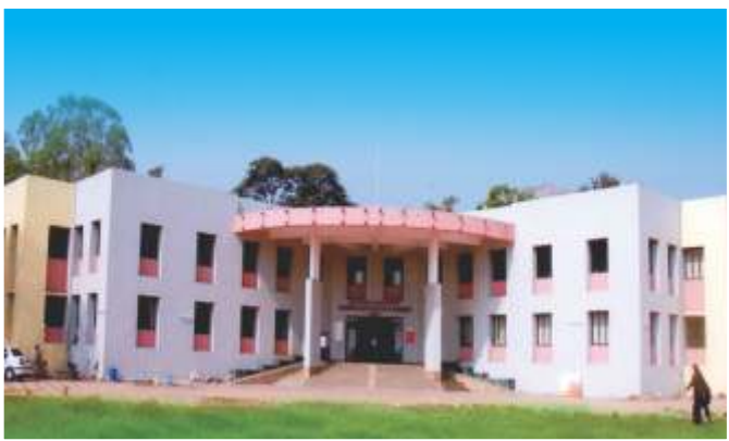
Yashwantrao Mohite Institute of Management, Karad