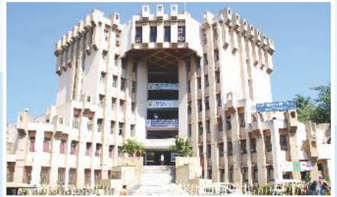
Institute of Management and Rural Development Administration, Sangli