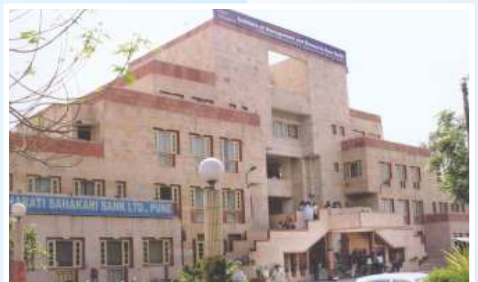
Institute of Management and Research, New Delhi