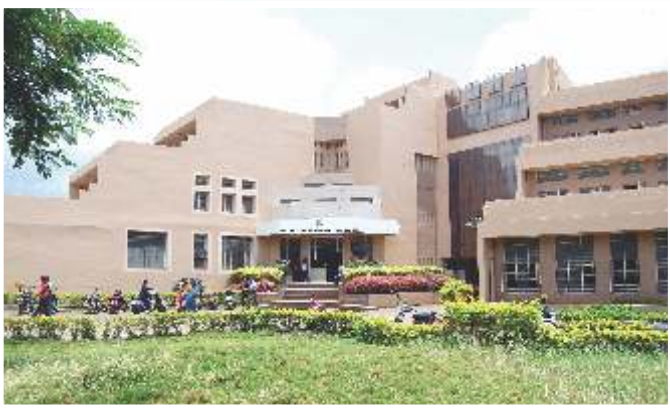
Institute of Management, Kolhapur